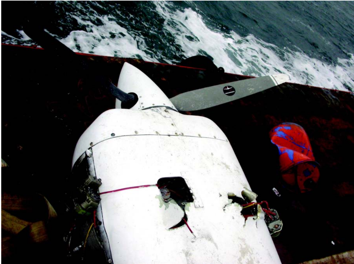
Figure 3. Exterior of the upper outboard engine cowling.

The right engine was removed and examined, under Safety Board supervision, at TCM's facility. After engine disassembly at TCM, some of the right engine components were brought to the Safety Board's Materials Laboratory in Washington, D.C., for further examination. For additional information about the metallurgical inspections of the right engine components, see section 1.16.3.