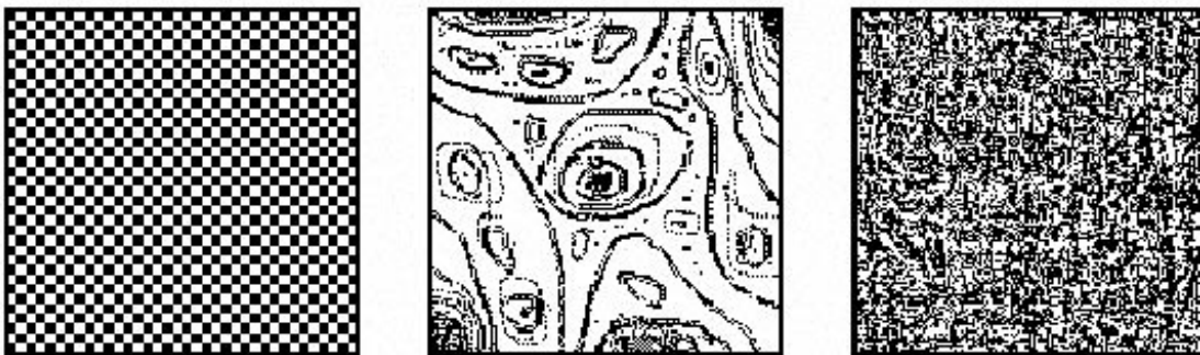
Figure 1. Variety increases from left to right, yet the human perceives the middle one the most complex (Grassberger 1991)

In addition to generalizing from the literature that complexity is the combination of three basic factors, we also identified two principles that contribute to the great diversity of complexity measures. One principle is observer dependency. As Edmonds (1999) described, "complexity only makes sense when considered relative to a given observer." One example would be the experiment performed by Grassberger (1991), where subjects were asked to assess the complexity of a set of images. Figure 1 shows three images that Grassberger used in experiments. The variety of the images, measured as the disorder of image pixels, increased from left to right, yet subjects perceived the middle one as the most complex. One explanation for this result is that the human visual system processes features such as orientation and spatial frequency rather than individual pixels per se. This experiment indicates that the impact of the variety factor on complexity depends on how observers process information.