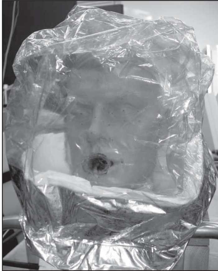
Figure 1. The Emergency Passenger Oxygen System evaluated in this study. The unit contains a single oxygen cylinder (not visible) that is normally opened to the interior of the unit when taken from the packaging for donning.