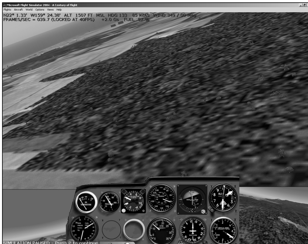
Figure 3. Screen Captures of MFS Windows Configuration for Upset-recovery Training

It appears that rote responses in upset-recovery maneuvering can be taught as effectively with MFS as with the motion based GL2000 simulator. The first of these responses involves using visual cues to determine pitch and bank angles during an upset. As shown in Figure 3, MFS, as implemented at ERAU, provides three simultaneous views outside the cockpit: 90° left, forward, and 90° right. The forward view is used to categorize an upset as nose-high or nose-low, while the two side views allow a pilot to determine bank angle, including whether the aircraft is upright or inverted. The second rote response is proper use of throttle—application of full thrust in nose-high upsets and reduction of throttle to idle in nose-low upsets. It is possible that participant pilots might have been better prepared for GL2000 training had they previously practiced these rote responses on MFS or received more GL2000 no-motion practice. Repetition is a powerful learning reinforcement for such responses.