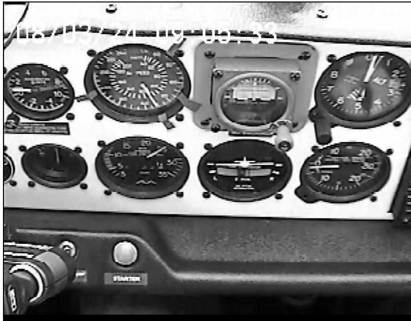
Figure 1. Sample Decathlon Video Recorder Output