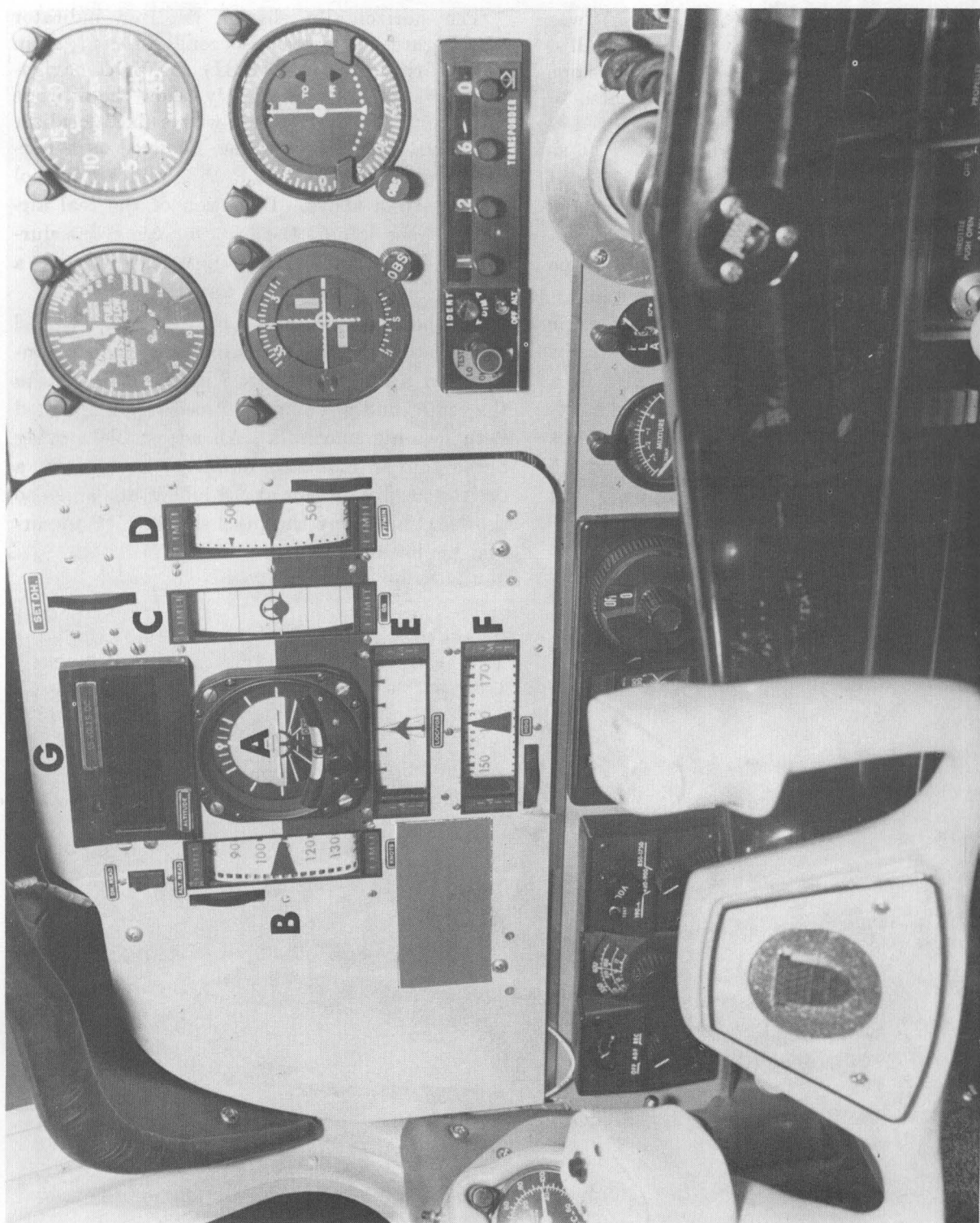
FIGURE 1. Peripheral vision flight display (PVFD), installed in Beechcraft Bonanza 35A, used to measure pilot performance during ILS approaches. A—Attitude Indicator, B—Airspeed Indicator, C—Glidepath Indicator, D—Vertical Speed Indicator, E—Localizer Indicator, F—Heading Indicator, and G—Altimeter.