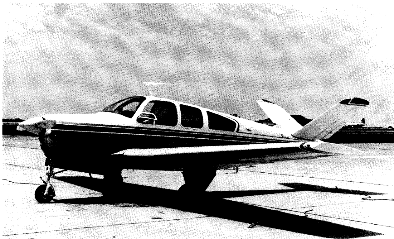
FIGURE 2. Beechcraft Bonanza 35A used in peripheral vision flight display study.

The heading indicator (F, Figure 1), placed immediately below the localizer instrument, consisted of a horizontal case with a lubber line in the center and a moving, servoed tape imprinted with heading numerals. An adjustable moving black pointer indicated deviation away from a desired heading preset at the lubber line and also showed which way the pilot should turn to correct his heading.