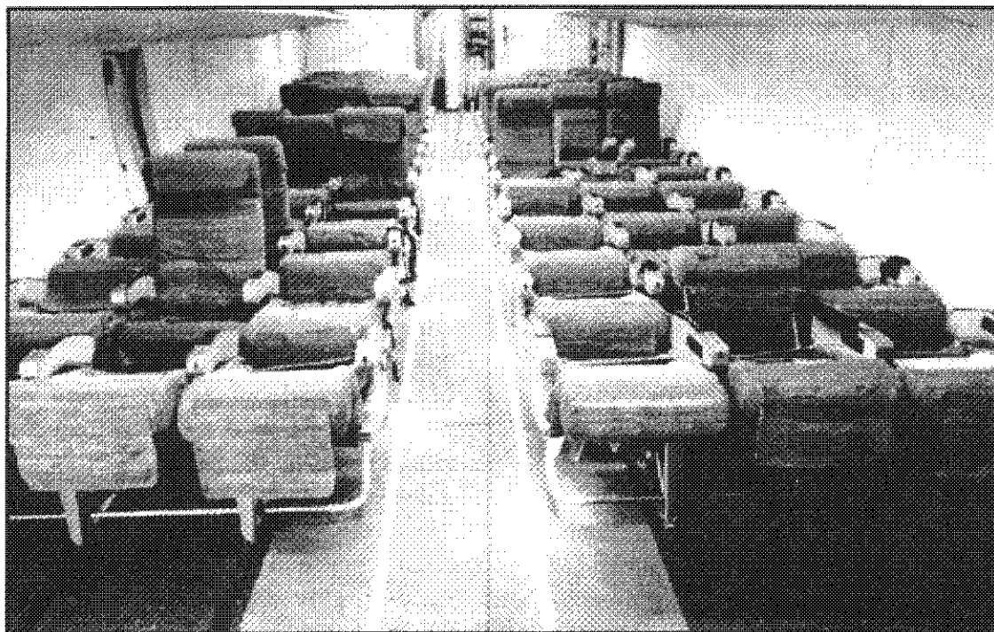
Cabin Interior After Competitive Trial

Figure 9 shows the broken-over seat backs typical of the cabin interior after a competitive trial; in contrast, all seat backs were always upright after the cooperative trials.