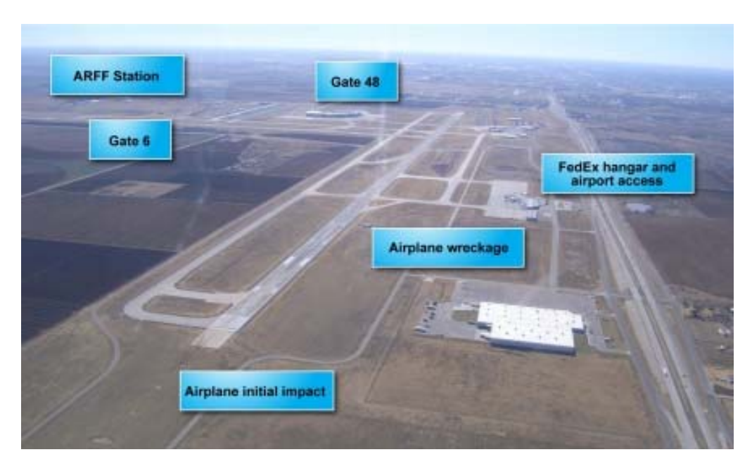
Figure 5. View of airport showing relative locations of airport access gates and accident site.

The first Lubbock Fire Department unit arrived on scene at 0457:27. At that time, the ARFF units had contained the fire, with the exception of a few deep-seated cargo fires inside the airplane. The Lubbock Station 2 battalion chief assumed incident command and informed the ARFF captain that the flight crew was at the FedEx hangar. The ARFF captain stopped the search for survivors, and ARFF personnel resumed their fire suppression activities. The Station 2 battalion chief and ARFF personnel indicated that the ATCT controller later called and stated that a pilot was walking around on the ramp looking for assistance, and a second search for survivors was initiated. ARFF personnel determined that both pilots were being transported to a local hospital, and the emphasis on fire suppression resumed.