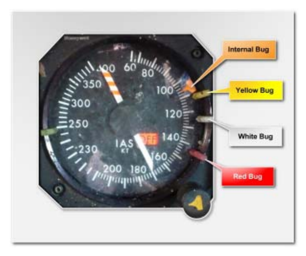
Figure 4. Airspeed indicator showing needle pointer; selector knob; and internal, yellow, white, and red bugs.

The other three indices, which are located on the outside of the glass face of the airspeed indicator, are color coded for use in referencing certain airspeeds during takeoff or landing and are manually positioned by the pilot. Unlike the internal bug's function, the pilot's positioning of these three indices (yellow, white, and red) does not affect any other systems or displays. The ATR 42 pilot handbook states that, for an approach, the yellow bug should be set to reference V_{ga} , which is the approach airspeed for 30° flaps plus 5 kts (not corrected for wind effect).<sup>25</sup> Similarly, the white bug should be set to reference V_{mLB}0 normal, which is the minimum airspeed for an approach with 0° flaps in nonicing conditions, and the red bug should be set to reference V_{mLB}0 icing, which is the minimum airspeed for an approach with 0° flaps in icing conditions. Figure 4 is an airspeed indicator showing the needle pointer; selector knob; and internal, yellow, white, and red bugs.