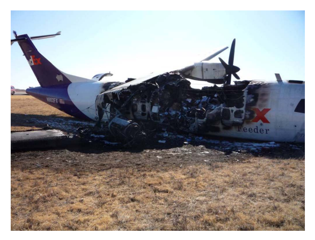
Figure 6. Right side of fuselage showing extensive fire damage to right wing and flap components.

The cockpit flap control lever was found in the 15° position. Examination of the flap system components at the accident site found that the left wing and flap components were intact and covered with soot. The right inboard and outboard flaps and the right inboard flap actuator were extensively damaged by impact and fire. Figure 6 is the right side of the fuselage, showing extensive fire damage to the right wing and flap components. The right outboard flap actuator was found in the retracted position on the ground under the right wing. Damage to the right flaps limited the extent to which preimpact system integrity could be determined. Examination of the available components revealed no evidence of mechanical restriction of movement of the right flaps.