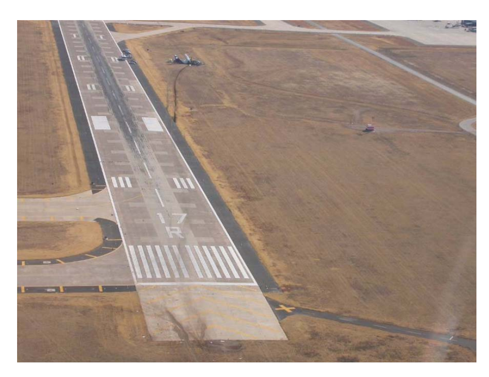
Figure 1. Aerial view of approach end of runway 17R and location of wreckage.