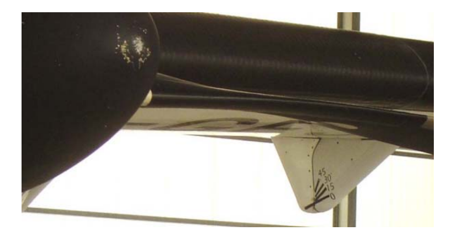
Figure 3. Exterior flap position fairing.

In addition to the cockpit flap position indicator, exterior flap position fairings mounted on the wings (one per wing) are visible to each flight crewmember through their respective side windows. These fairings are also marked with lines and numbers for the four flap positions, providing flight crews with a visual indication of the actual position of each flap. Figure 3 shows the exterior flap position fairing. The wing flap position fairings are illuminated by the wing lights during nighttime use. If a flap asymmetry occurs, the actual positions of the right and left flaps will be indicated on the respective flap position fairings.