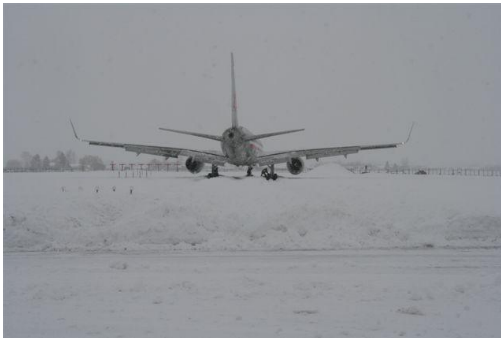
Figure 1. A photograph of the incident airplane, viewed from behind, where it came to a stop in the snow off the departure end of runway 19 at JAC.

When the airplane was stopped in the snow, the captain told the flight attendants not to evacuate immediately; he checked on the condition of the passengers and the airplane and determined that it was safer to remain in the airplane until help arrived. In the meantime, the first officer advised JAC air traffic control and American Airlines operations personnel that they had run off the end of the runway and would need assistance. All occupants remained on board the airplane until JAC ground personnel reached the airplane to assist in the occupants' egress. Postincident examination of the airplane revealed minor damage to the airplane. Figures 1 and 2 show the incident airplane where it came to a stop in the snow off the departure end of runway 19 at JAC.