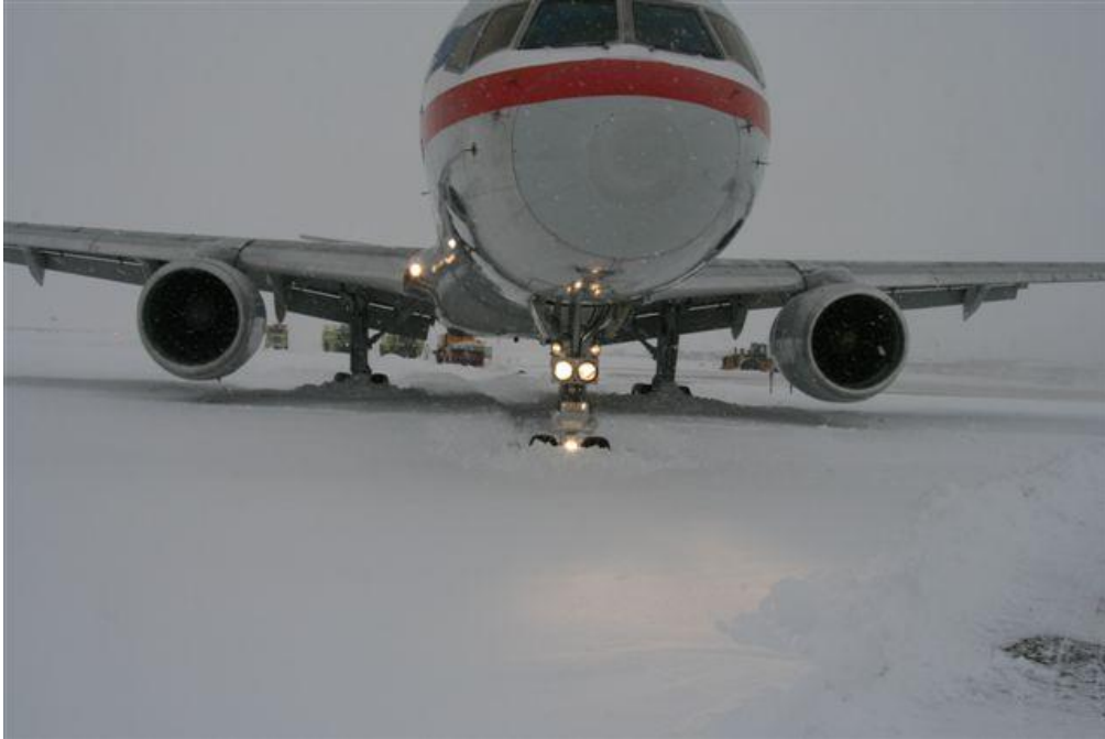
Figure 2. A photograph of the front of the incident airplane where it came to a stop in the snow off the departure end of runway 19 at JAC.