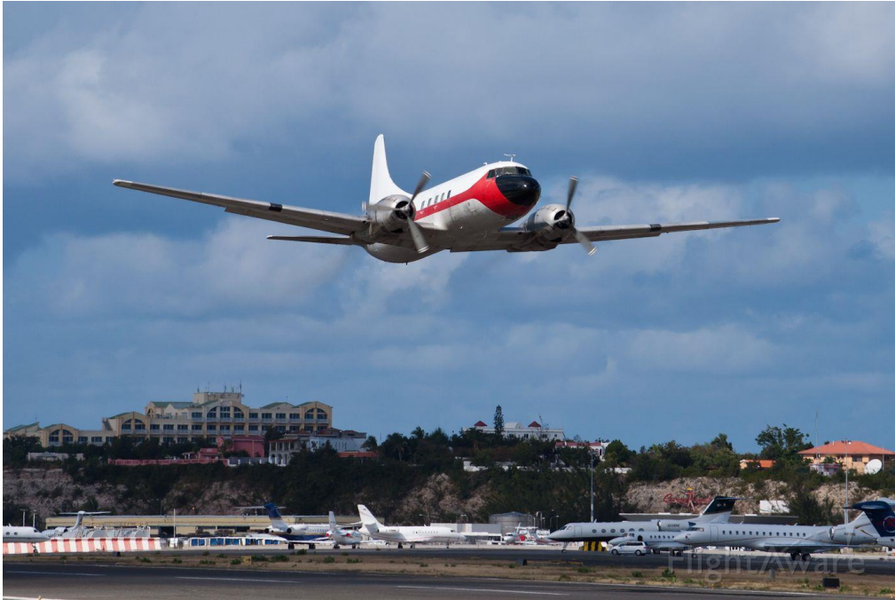
Figure 2. Preaccident photograph of N153JR.

The CV-440 exhaust system includes two manifold assemblies, two tubular thrust augmentor assemblies, a transition assembly, and a muffler for each engine, as illustrated in figure 3. The augmentor tubes are located in the upper body section of the engine nacelle; their purpose is to channel engine exhaust gases and cylinder cooling air from the power section and exhaust them through a muffler. The augmentor tubes also serve as heat exchangers by circulating air through the spaces between the airplane's inner and outer skin. This heated air is used directly for thermal anti-icing and as the source of heat for the cabin heat exchanger. A mechanic familiar with the Convair CV-440 noted that exhaust fires can occur in the augmentors on this type of airplane. Under normal conditions, the fire is exhausted out the muffler assembly and into the air, resulting in little or no damage to the airplane. However, the mechanic noted that oil and fuel leaks at the augmentor/muffler junction do occur.