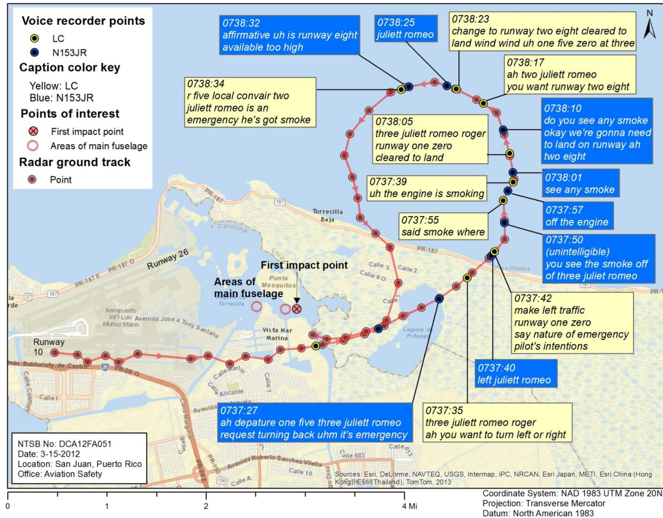
Figure 1. Radar ground track and ATC communications during N153JR's takeoff and attempted return to SJU.