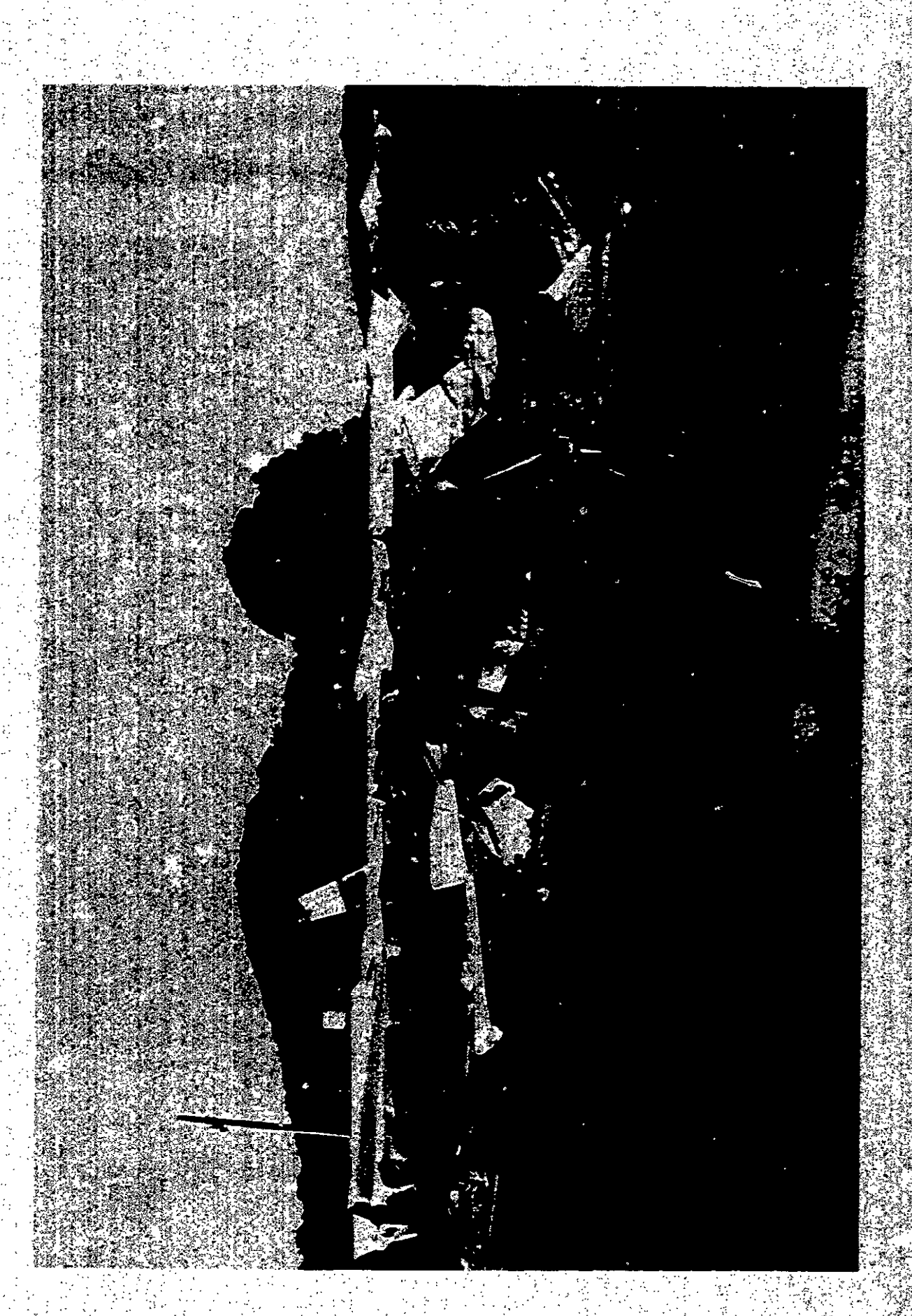
Figure 2: - Britten-Nörman BN: 2A-6 lauarden Nass K.