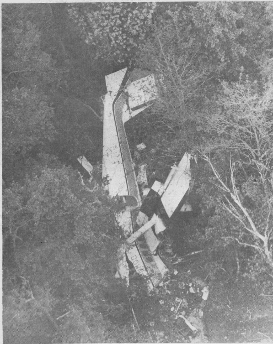
Figure 2.—Aerial view of accident aircraft.